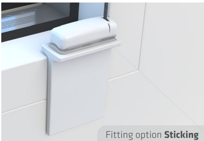
Fitting option Sticking