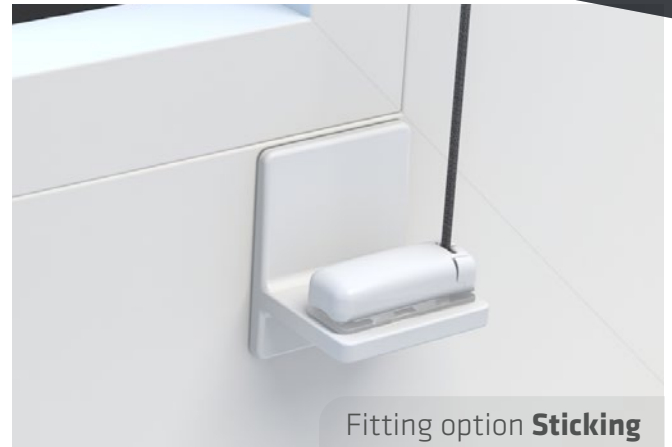
Fitting option Sticking