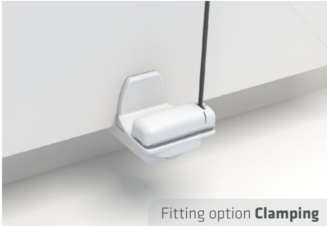
Fitting option Clamping