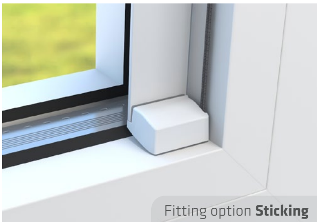
Fitting option Sticking