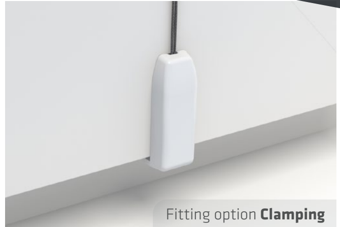
Fitting option Clamping