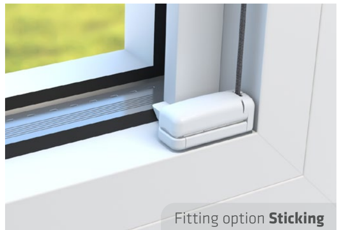
Fitting option Sticking