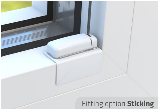
Fitting option Sticking